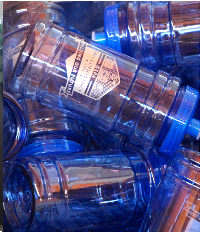
This year attendees received water bottles as give aways.