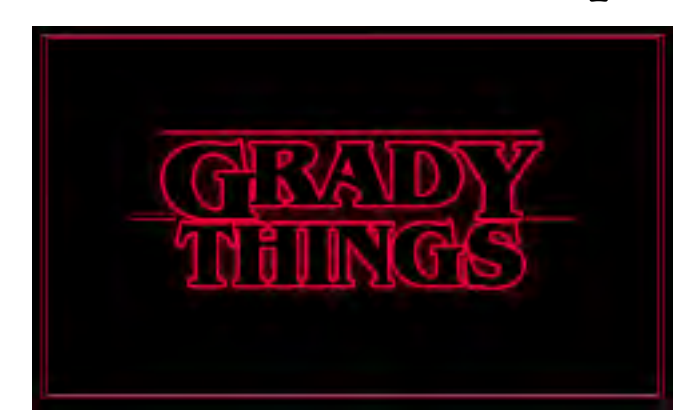
June 3-8, 2018

The Media & Leadership Academy at Grady College is an intensive residential one-week program focused on experiential learning. This program is open to rising high school sophomores to seniors interested in the mass communication field. Incoming UGA freshmen who intend to pursue a Grady College major also are eligible to attend.